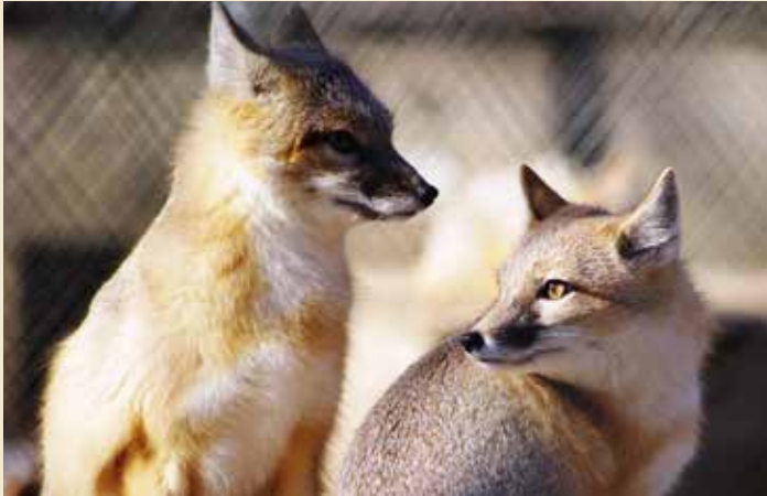
Two of our swift foxes at the Endangered Wolf Center.

The Endangered Wolf Center is proud to welcome Emerson as the sponsor of Wolf Fest 2014, our annual open house on Saturday, Sept. 27. The theme again will be one of nature and wildlife and conservation. Among the exhibitors will be Conservation Ambassadors, the Butterfly House, Longmeadow