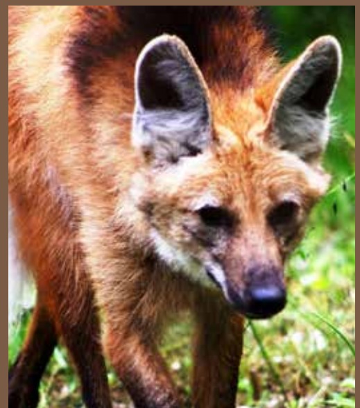
Freesia, one of our two female maned wolves.

Do you work for a business or corporation that has a matching gift program? If so, your gift can be matched dollar for dollar or on a 2-to-1 or even 3-to-1 basis! Some companies also have a matching gift program for your volunteer hours. To learn more, contact your HR department.