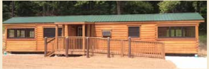
The August A. Busch III Charitable Trust donated the new office.

In late June, our Development and Administrative staff members moved their offices into our beautiful new oak log trailer, which was generously donated by the August A. Busch