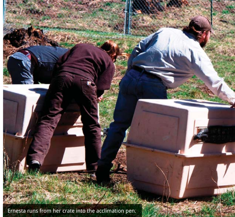
Ernesta runs from her crate into the acclimation pen.

Wesley and his mate, Ernesta, now known as the Coronado Pack, were getting ready for the birth of their pups. Their acclimation pen had been placed in an area that was formerly Rim Pack territory. It was thought that the depleted Rim Pack, now consisting of a lone male wolf, had vacated the area. The goal was for the Coronado Pack to replace the Rim Pack in the territory, bringing with them new genetics to increase the health of the small wild population.